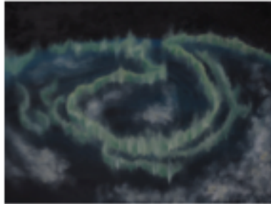
“Catching Solar Flares”

This painting is an impressionistic view of the collision of the earth's magnetic field and the sun's solar radiation, which is one of the most beautiful phenomena visible in nature on earth: the Aurora Borealis. This perspective, just above the earth, attempts to capture the spectacle of solar radiation sub-storms occurring while one of the sun's spots is facing in the earth's direction. As the clouds swirl above the earth veiling the stars, the Aurora Borealis displays showers of light for the onlookers below.